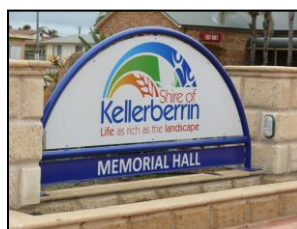
Example of Shire of Kellerberrin Signage.