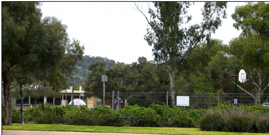
Shire of Kellerberrin, Main Road Amenity and Appropriate Public Open Space.

Included in the services and infrastructure the Shire of Kellerberrin provide for the community is Public Open Spaces such as parks and reserves. In the SCP, the Community of Kellerberrin, identified the aspiration to present a Shire with high visual and aesthetic appeal to neighbouring Shire Councils and visitors. Maintaining Public Open Spaces at an appropriate level, cost effectively, is an ongoing challenge.