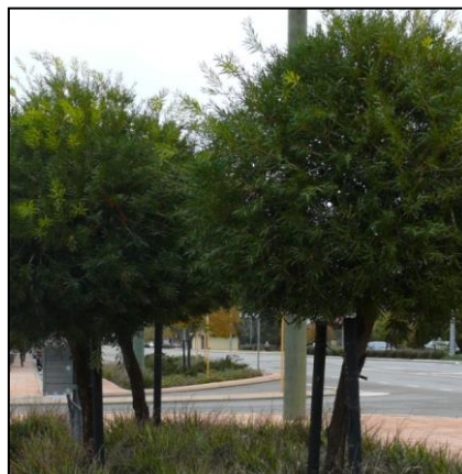
Example of shrubs and native plants that could be used under power lines along road verges.