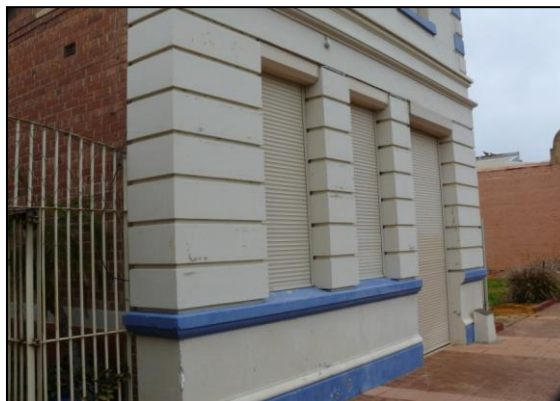
Example of appropriate covering for windows and external doors - if required.