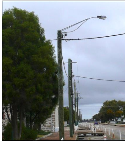
Example of trees clear of power lines.