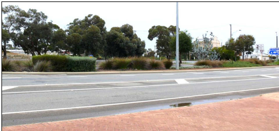
Townscape, Great Eastern Highway, Kellerberrin, June 2016

Delivering sustainable solutions will require Council working with a wide variety of residents, businesses, developers and companies within the region.