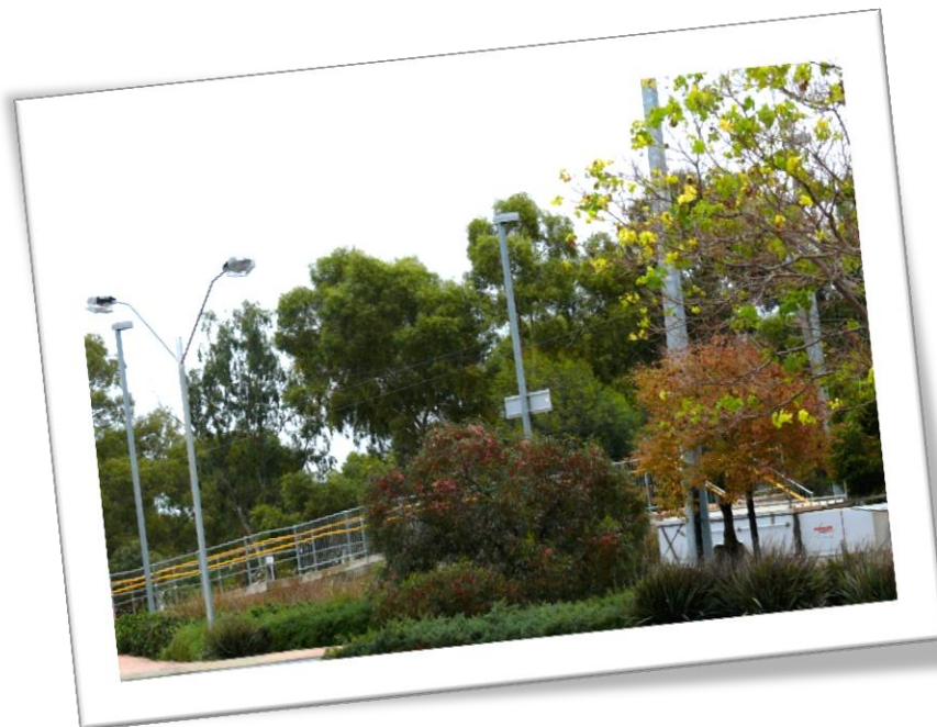
Kellerberrin, June 2016.