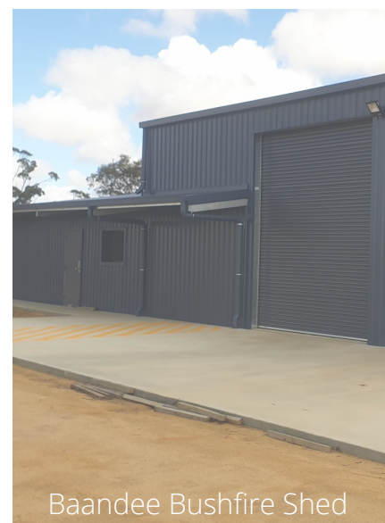
Baandee Bushfire Shed

Opening hours or ticket prices please visit Councils website.